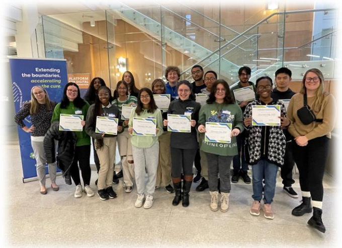
Odyssey Charter School, AP Biology Students

Do you enjoy learning about new healthcare advances, fascinating treatments, and groundbreaking research?